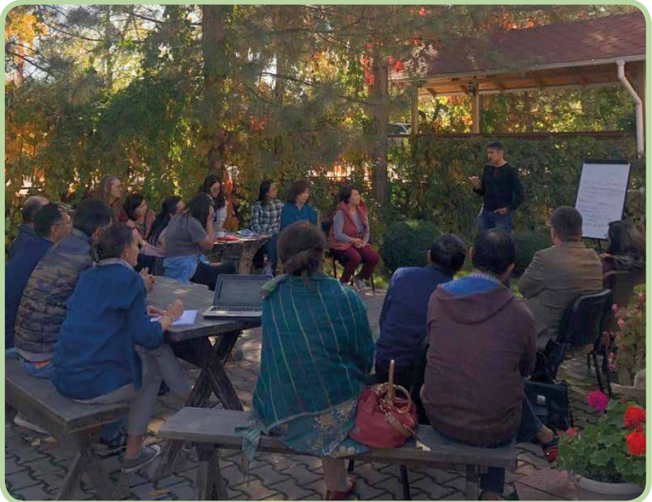
Figure 2: It is great to have some of the discussion outdoors, if your venue offers you that opportunity