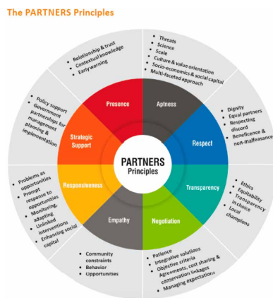
Figure 3: A detailed visual representation of the eight PARTNERS Principles for effective and respectful community-based conservation.

The concluding session of the workshop is to introduce the participants to the PARTNERS principles.