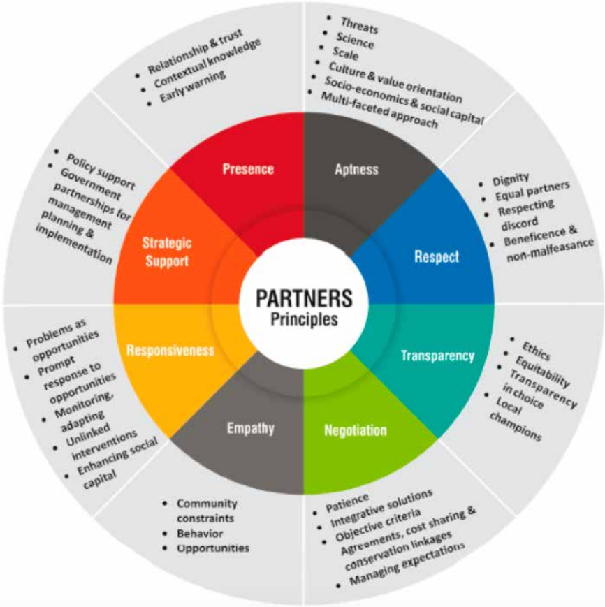
Figure 3: A detailed visual representation of the eight PARTNERS Principles for effective and respectful community-based conservation.