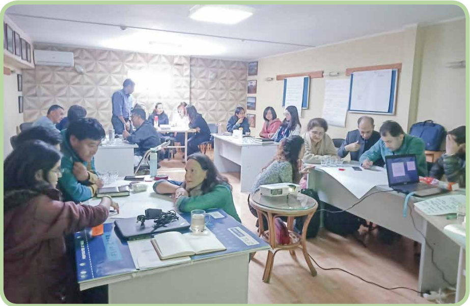
Figure 1: The setting for a typical PARTNERS workshop can be simple and informal allowing participants to share and exchange their conservation experiences